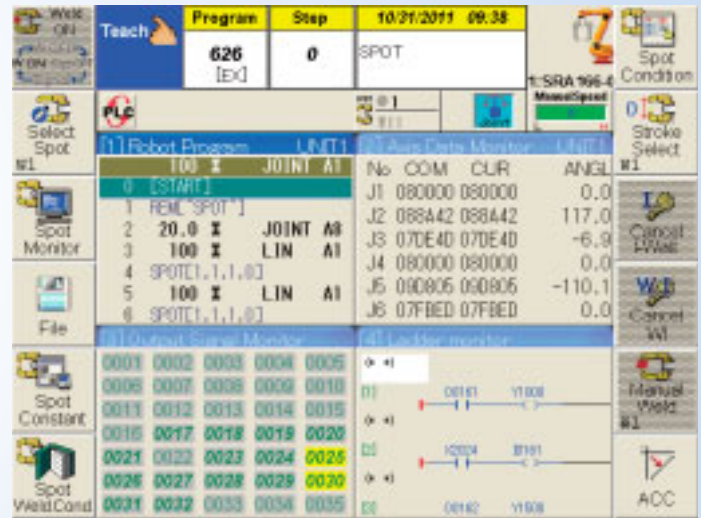
Multi-window display assists easy operation